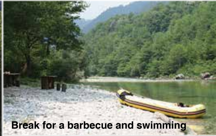
Break for a barbecue and swimming