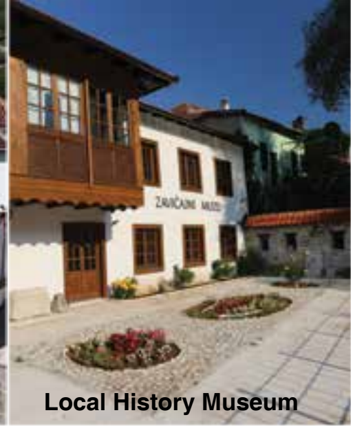
Local History Museum