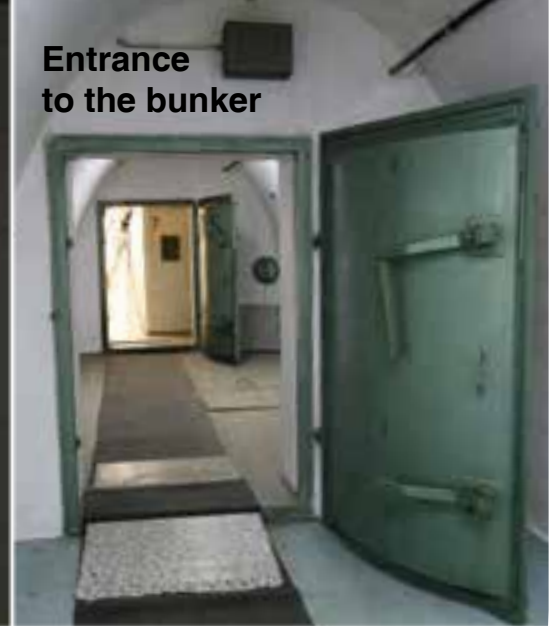
Entrance to the bunker