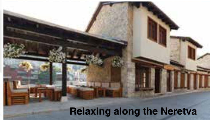
Relaxing along the Neretva