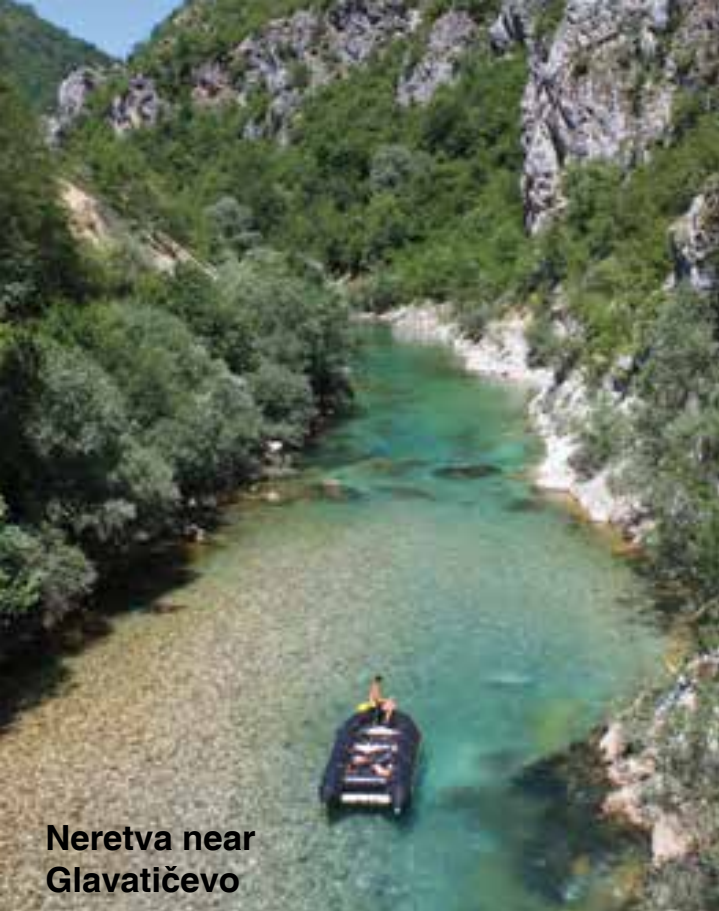
Neretva near Glavatičevo