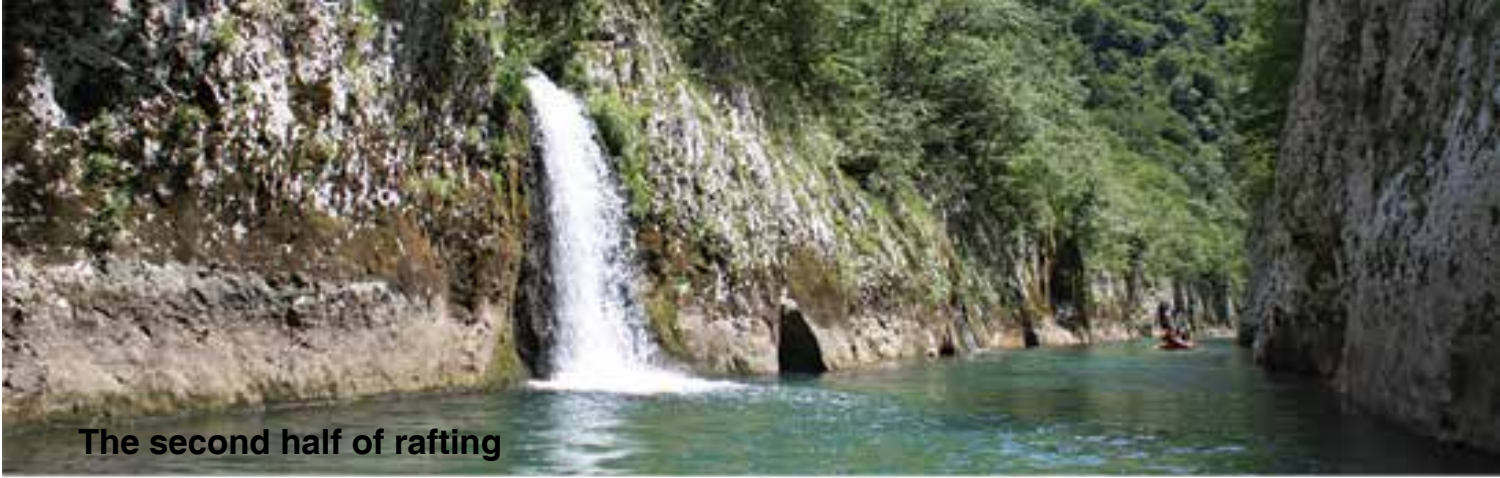
The second half of rafting