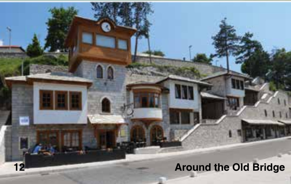
Around the Old Bridge