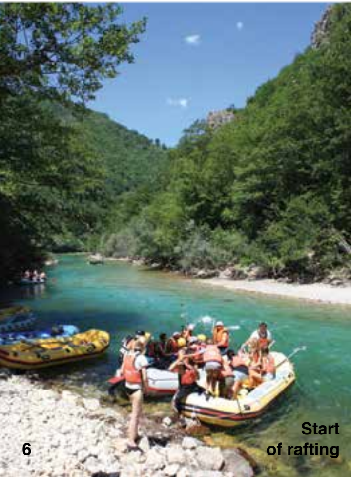
Start of rafting