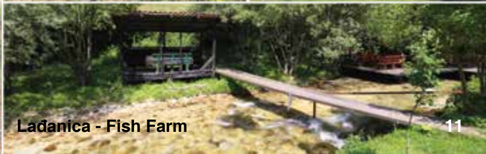
Lađanica - Fish Farm