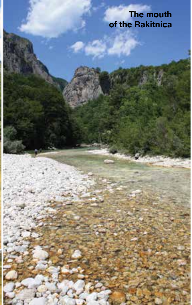
The mouth of the Rakitnica