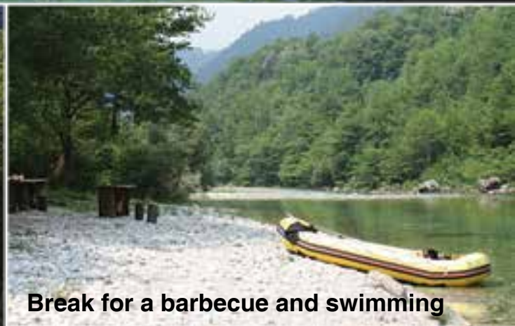
Break for a barbecue and swimming