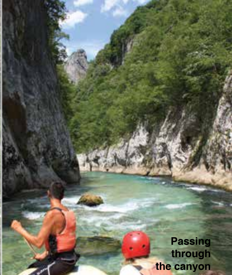
Passing through the canyon