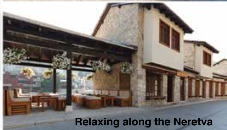
Relaxing along the Neretva